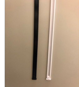
Twist-In Power Jumper: